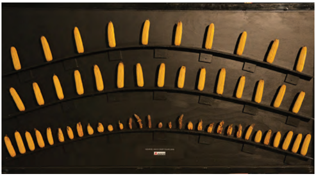
See the difference in spacing that occurs without turn compensation on a planter and how that impacts yield.** \,

Climate FieldView™ map showing the population difference between vDrive's turn compensation and a typical ground driven system.